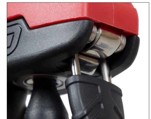
ONE-STEP CLICK-IN RELOAD