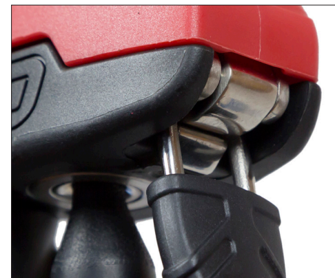
ONE-STEP CLICK-IN RELOAD