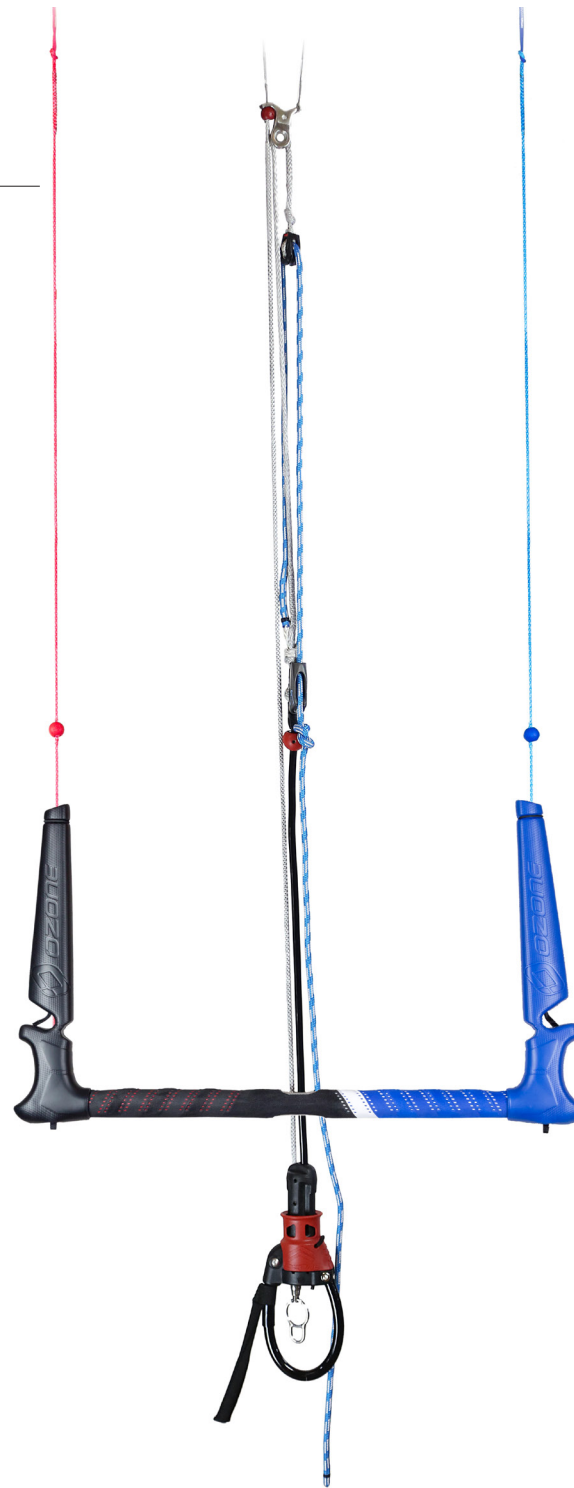
• STAINLESS STEEL TRIMMER BRACKET