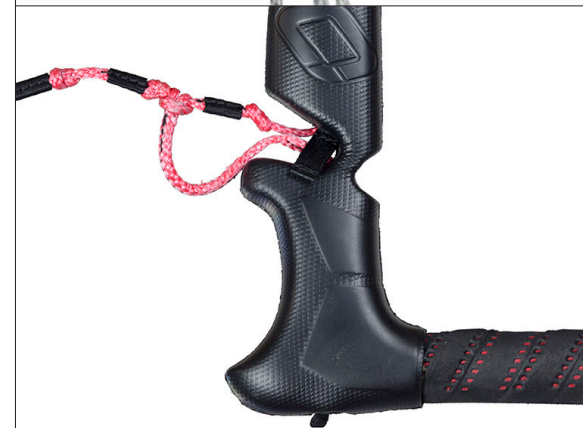
• SOFT BAR ENDS WITH LEADER LINE ADJUSTMENT