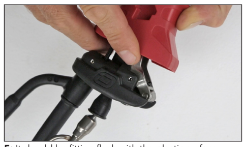
5: It should be fitting flush with the plastic surface on each side. It should not interfere with the release handle.