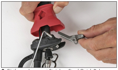
3: Fit the replacement Stainless Steel Quick Release Lever into the Click-In Loop body.