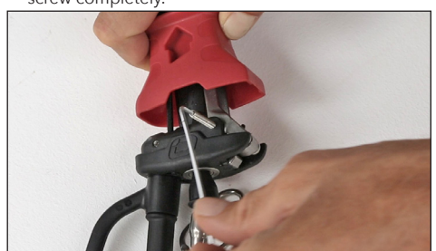
4: Wind the Hex screw back in.