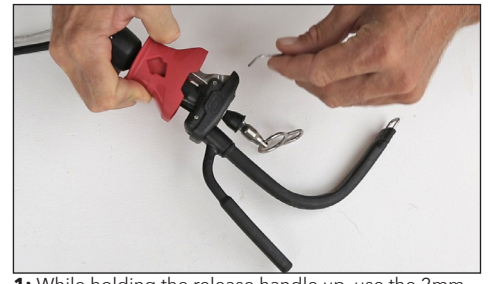
1: While holding the release handle up, use the 2mm Hex key to unwind the Hex screw that is securing the Stainless Steel Release Lever in place.