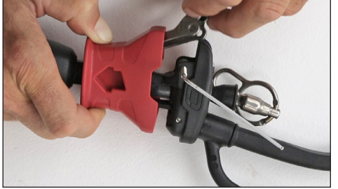
2: Unwind until the Stainless Steel Quick Release Lever can be removed. It is not necessary to unwind the screw completely.